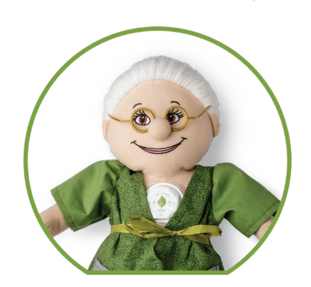
Learn more at SN-Leaf.com

Leaf is designed for acute care facilities, especially high-risk patients, such as those in critical care. Call us to see how Leaf could help your patients – and your team.